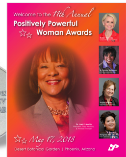
Winner Women in Business Stevie® Award, The World's Premier Business Award.